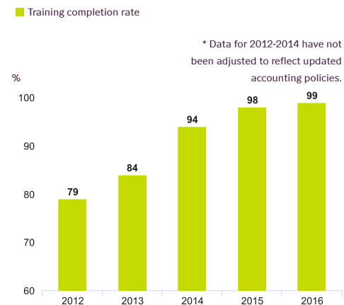
Business integrity training for employees*

The number of investigated fraud cases increased from 25 in 2015 to 44 in 2016. None of the investigated fraud cases, in both 2015 and 2016, had a material financial impact on Novozymes.